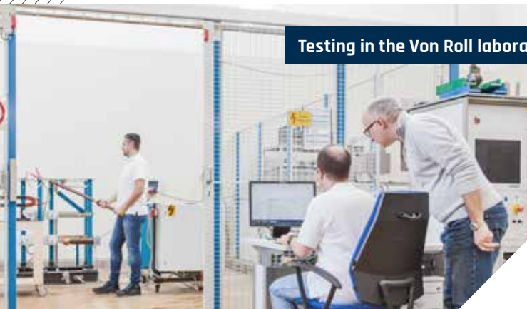
Testing in the Von Roll laboratory